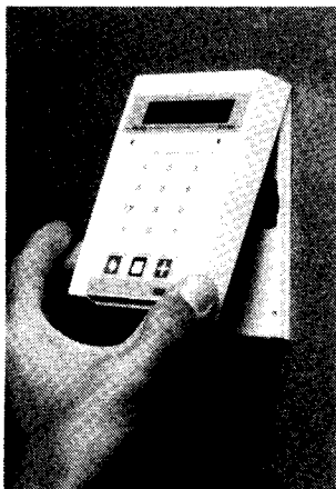
FIGURE 1 Mounting

To remove the control station insert a small screwdriver into one of the two holes at the bottom of the unit, while applying a light pulling action away from the mounting surface. After the first lock is disengaged, repeat for the second. Slide the unit upward so that the interlocking hinges detach and free the control station.